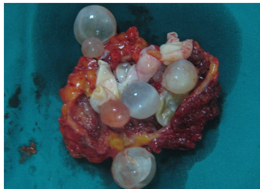
Figure 2 Soft Tissue(Total Excised)

Fine-needle aspiration was not attempted. It is important to establish the diagnosis preoperatively in order to limit the risk of anaphylactic shock or dissemination in the event of puncture or accidental opening of the cyst during resection. During surgical exploration under general anesthesia, the skin and subcutaneous layers were incised and the cyst was reached. Hypertonic saline was injected into the cyst and after waiting for 10 min, the cyst was completely excised (Figure 2).