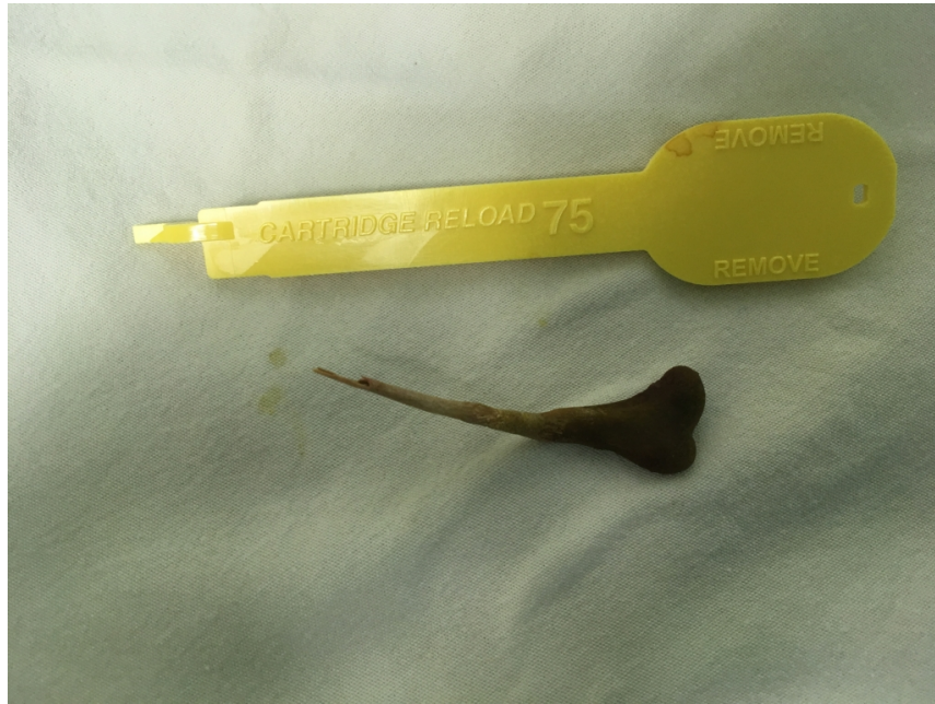
Figure 1 chicken bone

12.7 g / dl. Biochemistry values were within normal limits. In the abdominal computed tomography of the patient with intravenous contrast, an abdominal obstruction was seen at the superior surface of the umbilicus at the 2 sides of the abdominal wall and the hernia under the skin was observed. Correlated doppler showed strangulated herniated bowel loops in ultrasound examination and free air and fluid values were observed in the abdomen. The patient was thought to have perforated strangulated bowel and was decided that he should undergo an emergency surgical exploration. In the exploration, purulent fluid and diffuse adhesions were observed inside the hernia sac and in the abdomen. There was perforation in the bowel of the hernia. In this area, a foreign body was seen as a chicken bone (Figure 1).