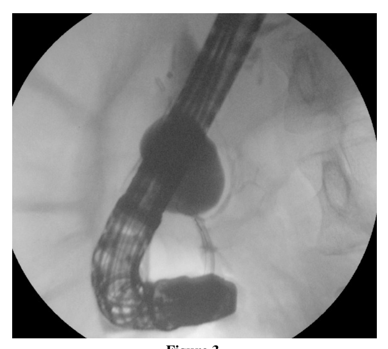
Figure 3 ERCP revealed cytic dilatation of the distal extrahepatic bile duct (remnant bile duct cyst)

During follow-up her complaints decreased and she was discharged to come to the control. Two weeks after her discharge, the patient was readmitted due to epigastric pain, nocturnal high fever and nausea. The stent was clogged and replaced with a new stent by ERCP. The symptoms were partially relieved after the ERCP but later her complaints repeated so it was decided to perform a Whipple procedure. After the procedure was approved by the patient, she underwent the resection of distal extrahepatic bile duct with standard pancreaticoduodenectomy. The histopathological examination for the resected specimen yielded the final diagnosis of remnant CC with no evidence of malignancy. The patient showed no postoperative complication and was discharged on the 7th postoperative day. She has been regularly followed at outpatient department with no evidence of abdominal symptoms more than one and a half years.