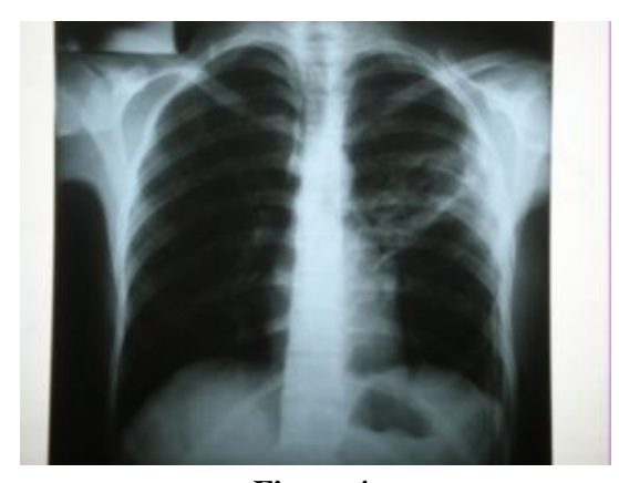
Figure 4 Postoperative chest x-ray

and his control chest x-ray was normal (Figure 4).