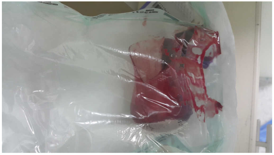
Figure 2B The partly broken tea cup that had been taken out of through the anus

Under general anesthesia, the tea cup shaped object was removed from the anus bimanually under lithotomy position (Figure 2B).