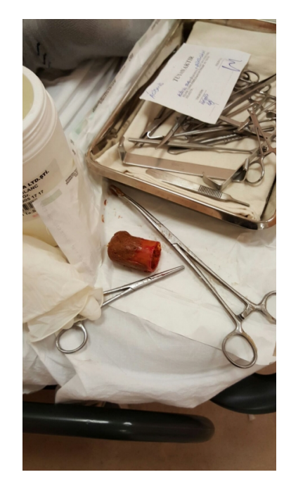
Figure 3B The deodorant cover that had been taken out of through the anus

The deodorant cover, which was handled in the rectum, was detonated slowly and taken out of the rectum under analgesia and muscle relaxants (Figure 3B). The abdominal x-ray was taken daily with the patient standing upright. Patient was discharged without any complications.