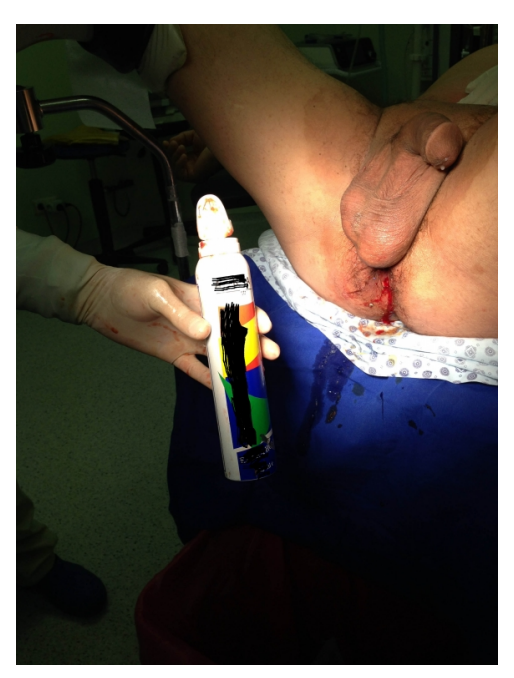
Figure 1B The hair spray box that had been taken out of through the anus

The procedure terminated in no need for any surgical intervention. There was no complications during postoperative period. Patient was discharged after observation with standing direct abdominal x-ray daily.