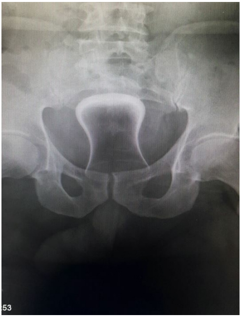
Figure 2A Plain abdominal X-Ray revealing presence of a tea cup shaped object in the rectosigmoid area

A 66-year-old male patient presented with complaints of being assaulted, having bruises and bleeding in the rectum. In the plain abdominal X-ray, a foreign body was observed in rectosigmoid area in the form of tea cup (Figure 2A).