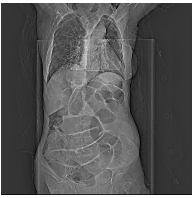
Figure 2 CT scout

There was a cut off sign at terminal ileum just close to the right femoral canal & obturator canal at the CT scan (Figure 3).