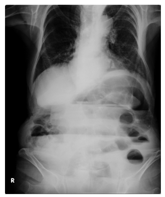
Figure 1 Abdominal X-ray

The abdominal x-rays were taken (Figure 1) which revealed dilated small bowels and no sight of gas in colon suggesting a distal jejuno-ileal obstruction. After that she was taken to CT scan. CT showed a marked dilatation of small bowels up to the terminal ileum without any sign of a mass (Figure 2). She was admitted to the ward for follow up.