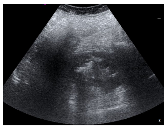
Figure 2 Sonogram shows hyperechoic stones in renal caliyxes.

Meticulous evaluation of the patient revealed no other source of fever (such as abscess or infection of any kind). Ultrasound examination revealed hyperechoic stones, however failed to demonstrate the gas bubbles within the stones (Figure 2).