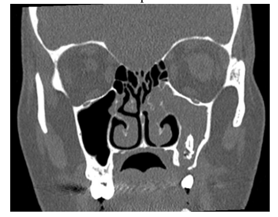
Figure 2 Coronal plane

During surgery, we exposed and removed the stone with endoscopic and transoral Caldwell-Luc technique together, then repaired oro-antral fistula with lateral mucosal flep and bones of maxillary sinus anterior wall obtained from transoral Caldwell-Luc technique. (Figure 3 and 4).