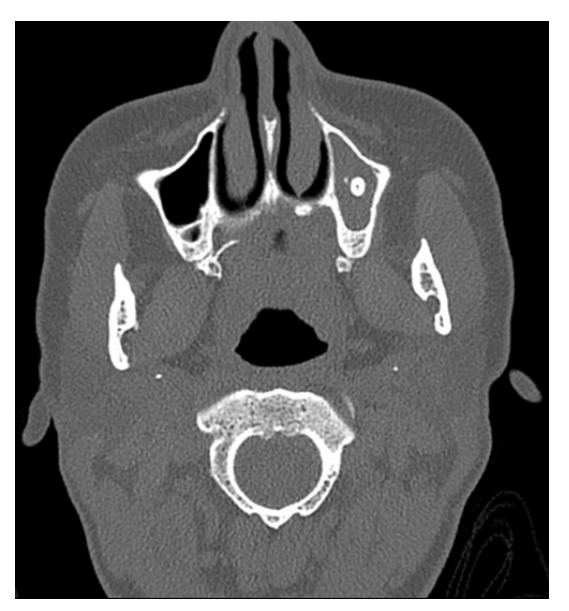
Figure 1 Axial plane