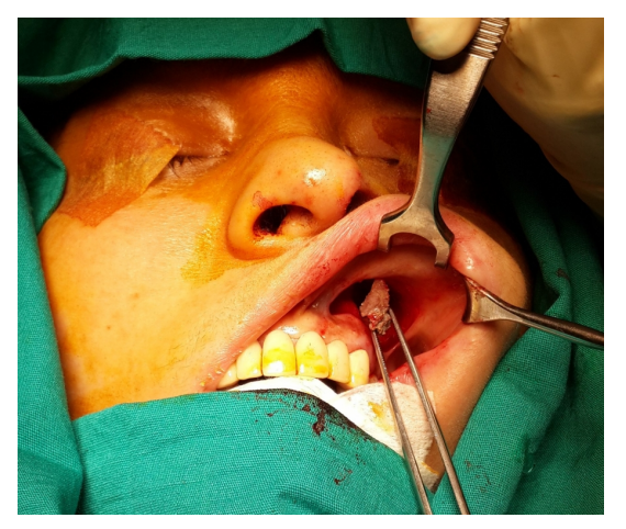
Figure 3 Intraoperative view